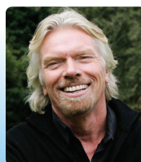
Sir Richard Branson Virgin's Chairman

"The best thing is not to be limited by traditional corporate careers but to be clear on what you want from life and get as much varied experience as you can pack in!"